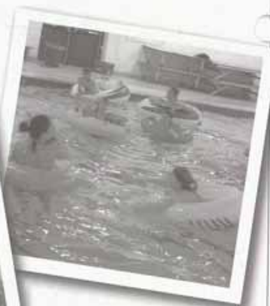
At Trent University, Intramural Innertube Ultimate Frisbee and Waterpolo offers unique prizes to teams with fun and crazy head gear. C